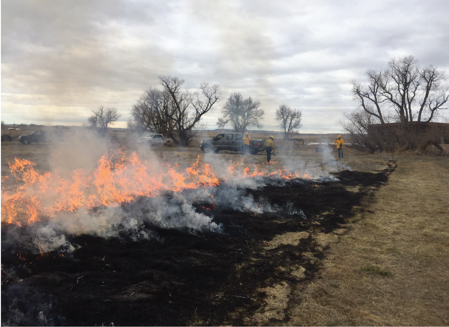
Create a firebreak around the home ignition zone with a prescribed fire before wildfire season. Make sure the burn occurs before conditions become too dry or burn bans restrict the ability to burn.